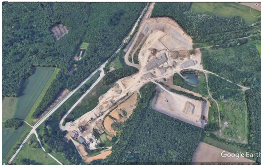
Figure 2 – Cava Campana quarry in Buscate

Since training and social involvement are two of the missions of our Club, we decided to offer Civil Protection Groups the opportunity to attend the driving courses, with the aim of train them on some conditions that can occur in real emergencies.